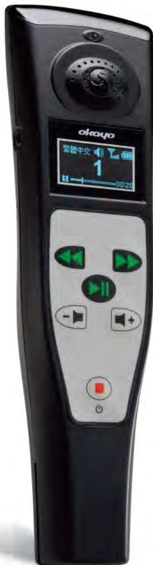
AT-300 linear guide